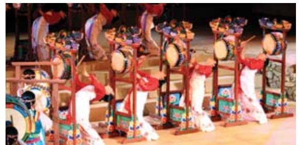
Many world culture events, like the 2005 Korean Dance Festival, are presented at the Ford.

Varied menu: Food and beverages are available in the outdoor snack bar on the amphitheatre level (3) or the indoor bar on the middle level (2).