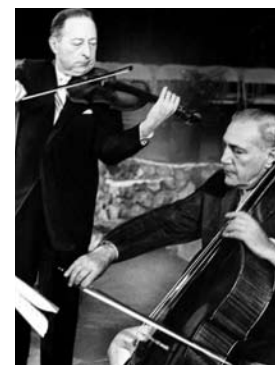
The Ford has an illustrious history of chamber music presentations. Jascha Heifetz, Gregor Piatagorsky and friends played at the theatre frequently in the 1950s and 1960s.