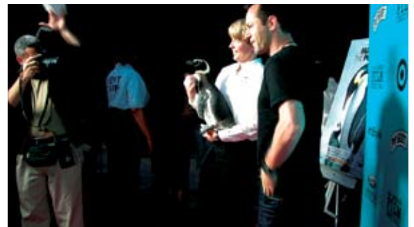
March of the Penguins had its L.A. premiere at the Ford in June 2005 as part of the Los Angeles Film Festival, one of a number of film events included in the summer season.