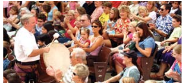
Children are admitted free to the Ford's Big!World!Fun! family series on Saturday morning.

Picnicking: You can dine in the terraced entryway or the amphitheatre. Bring your own food and beverage or take advantage of the options below.